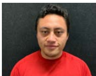
Pene Panapa Kaiarahi i te Reo